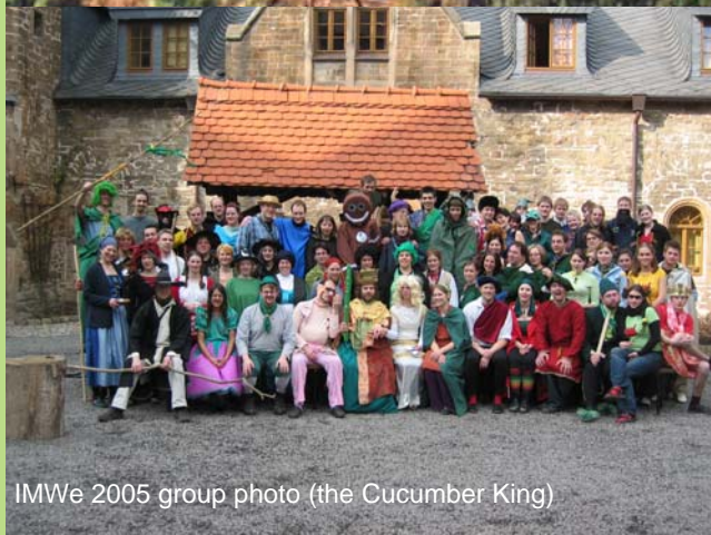
IMWe 2005 group photo (the Cucumber King)