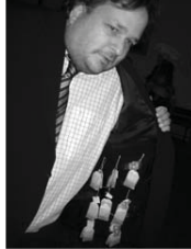
Black market tea dealer.