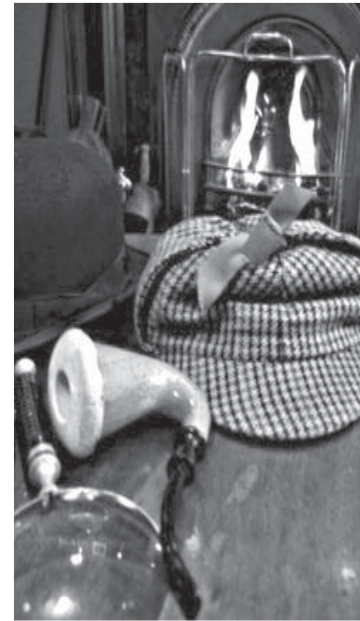
Is this the last we will see from our beloved detective Sherlock Holmes?

While Scotland Yard scurries after every tidbit of information like sewer rats, the public feeling of helplessness and insecurity grows day after day.