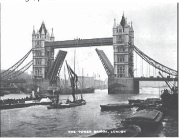
London's new pride: The Tower Bridge!

What do you do when you wake up in the morning, feeling low-spirited? Oh, why don't you just take a look at the marvellous peace of art that proudly crosses the River Thames?