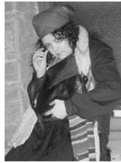
Gypsy Zophonia arrested for theft during the Queens visit.

Only a couple of days after the disappearance of London's most able detective, Sherlock Holmes, a shocking increase in criminal activity can be observed all over the city. Gypsies are now freely roaming the streets, offering their dubious goods to the unsuspecting citizen. Furthermore, the East India Company, our beloved provider of delicious tea varieties from our colonies, is complaining about shrinking sales due a constantly growing black market. The tea bags sold in that manner are of inferior quality at best, often laced with shredded agricultural waste. Ingestion is rated as a high health risk and is reported to lead to blindness, ergotism, leprosy and other serious medical conditions.