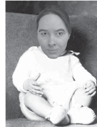
A picture of the young prince, provided by the Queens maid.