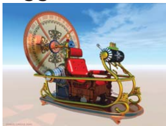
If you observe a device like this, don't be surprised if the lost Mr. Sherlock Holmes is sitting in it!

In those two years, no one ever heard of him or saw him, he appeared to have been swallowed by the ground. When two letters emerged on March 26th