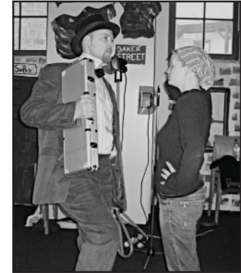
Better Times - Two Lovebirds in Baker Street.

In a spectacular show of unexpected competence the London Police yesterday succeeded in laying hands on Sir William Higglebottom, the key character in the linked mysteries of the kidnapping of H.M. Queen Victoria and disappearance of star investigator Mr. Sherlock Holmes.