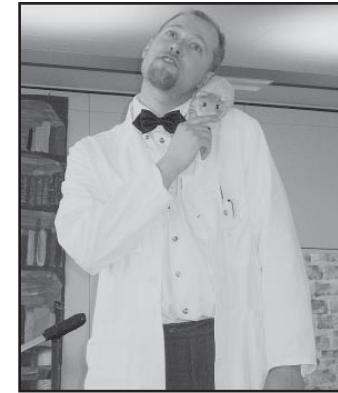
Sick Scientist Set in Slammer