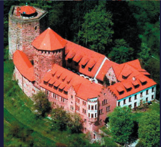
Burg Rieneck, where IMWe 2008 will take place.