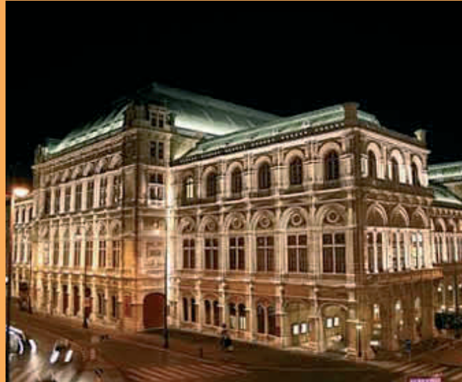
The Viennese State Opera 2009 - live at Rieneck Castle

Scouting.international.Fun.Experience.Friendship