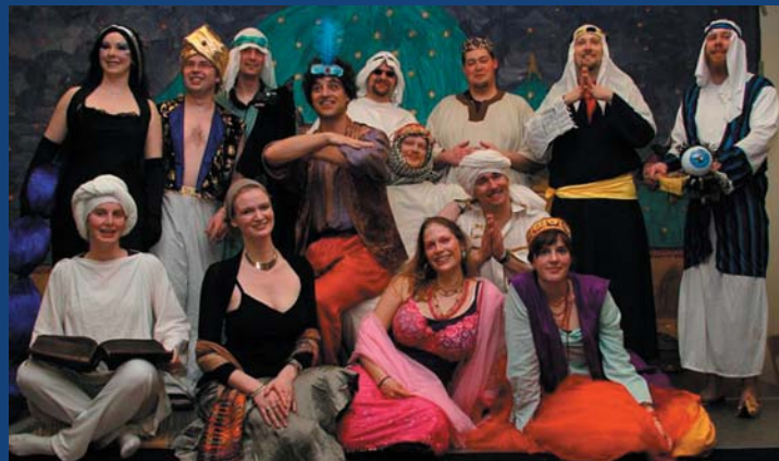
The IMWe Team - 2008, Arabian Nights 2010 - who will get lost in the jungle?